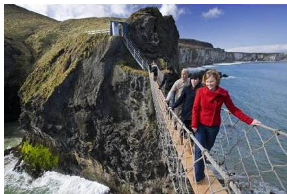
Carrick-a-Rede Rope Bridge

The bridge links the mainland to the tiny island of Carrick-a-rede.