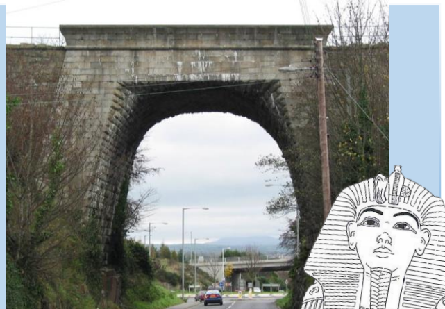
King Tutankhamun Mask – featuring the nemes, cobra and vulture