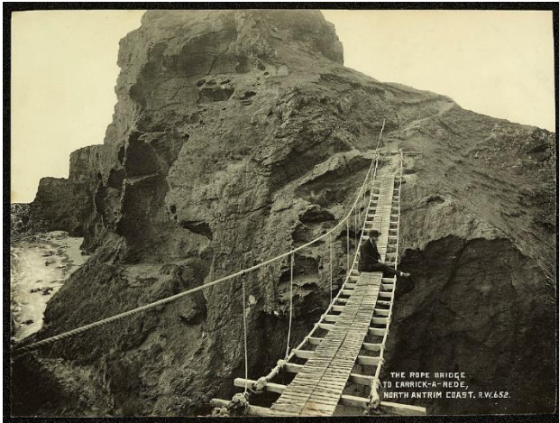
Carrick-a-Rede Rope Bridge c.1914

Carrick-a-Rede rope-bridge was first built by salmon fishermen 350 years ago